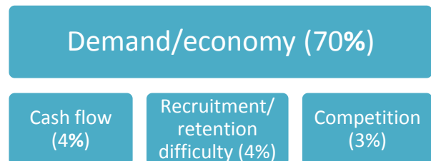
Chart 2: Greatest future concern

The Mackay region will be surveyed by the department again in 2016.