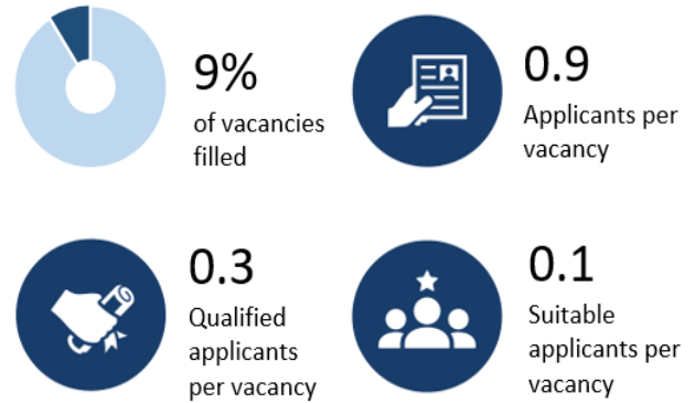
Figure 1: Survey results, Panelbeater, 2014 to 2018