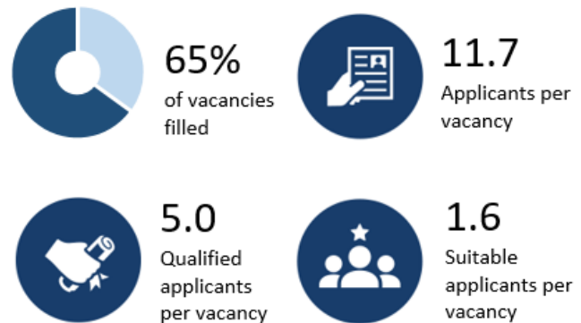
Figure 1: Survey results, Architect, 2015 to 2019